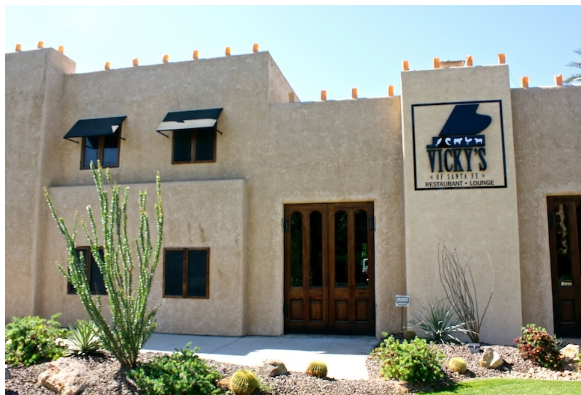
Vicky's of Santa Fe in Indian Wells was built in 1989 and originally was to be named Vanessa's of Santa Fe.